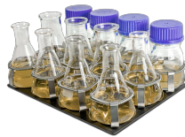
P-12/100 BS-010108-EK platform

Flat platform with non-slip silicone mat for Petri dishes, culture flasks, agglutination.