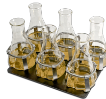
P-6/250 BS-010108-DK platform