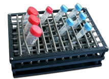
P-16/88 BS-010116-BK platform

Platform with spring holders for up to 88 tubes up to 30 mm diameter (e. g. 10 ml, 15 ml, 50 ml tubes).