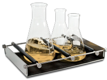
UP-12 BS-010108-AK platform

Universal platform with adjustable bars for different types of flasks, bottles, and beakers with silicone mat.